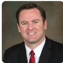
Will O'Neill Newport Beach Mayor Pro Tem Large City Representative