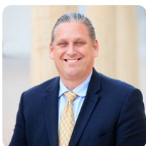
Tony Strickland Huntington Beach Mayor Large City Representative