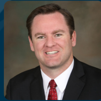
Will O'Neill Newport Beach Mayor Large City Representative