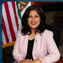
Farrah Khan Irvine Mayor Large City Representative